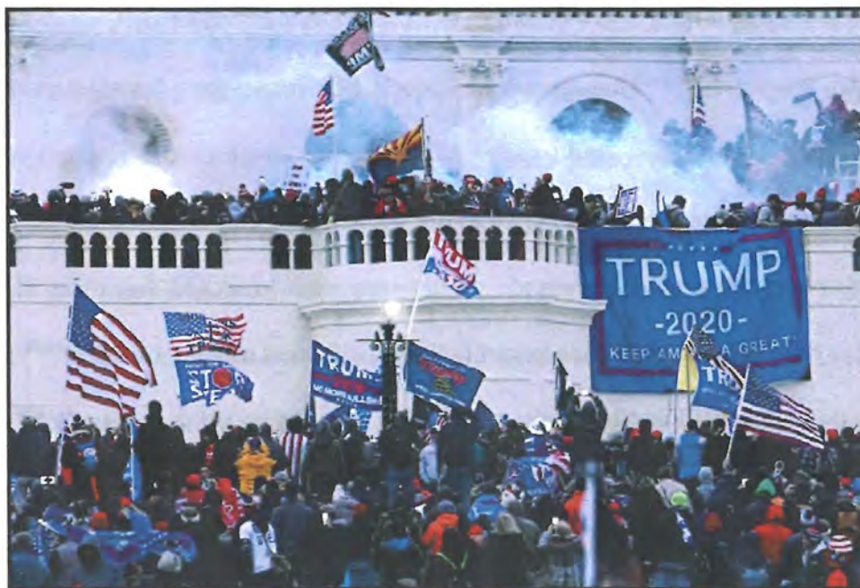
Photograph of the Capitol on January 6, 2021 112