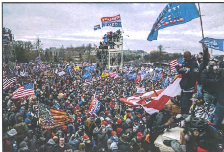
Photograph of the Capitol on January 6, 2021 113